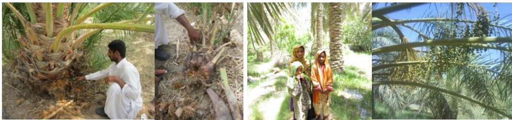
Fig. 5. Supplementary figures

We gratefully acknowledge local inhabitants and farmers for our study.