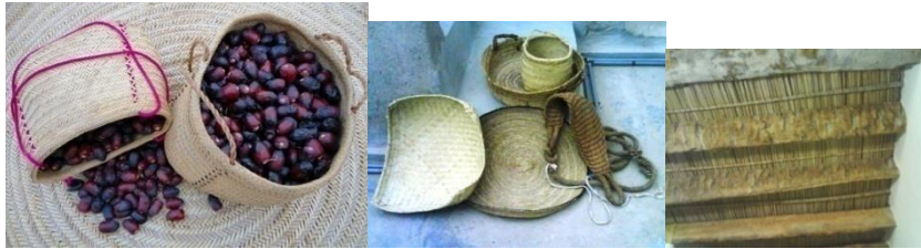
Fig. 4. Graph showing quantity sold to different agencies by farmers.