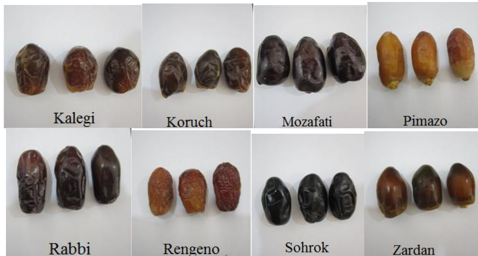
Fig. 3. Common date palm cultivars of Saravan