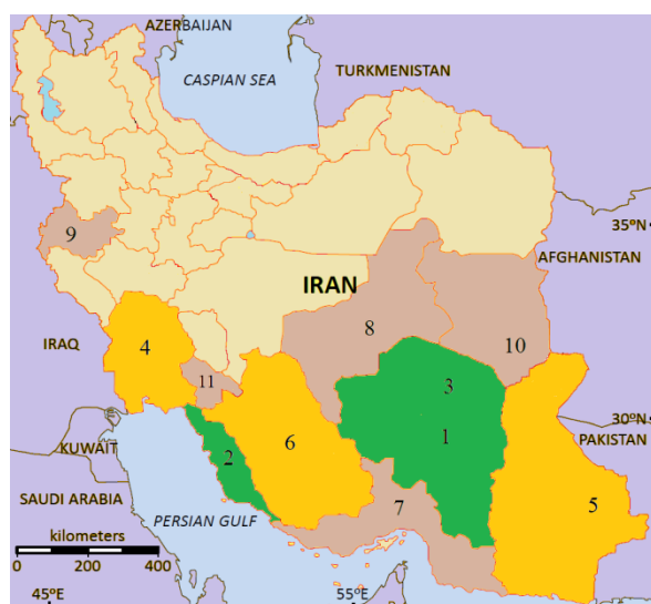
Fig. 1. Date palm cultivation region in Iran. The provinces sorted on the basis of average production, reported by Agriculture-Jihad ministry in 2011. 1: Jiroft region in Kerman, 2: Bushehr, 3: Kerman, 4: Khozestan, 5: Sistan and Baluchestan, 6: Fars, 7: Hormozgan, 8: Yazd, 9: Kermanshah, 10: South Khorasan, 11: Kohgiluyeh and Boyer-Ahmad

In Iran, date palm has been cultivated in 13 provinces. More than 99% of annual productions of this crop are from Hormozgan, Kerman, Fars, Sistan and Baluchistan, Bushehr, and Khozestan provinces (figure 1) (Hajian, 2005). Sistan and Baluchistan province has 42623.5 (hectare) dry and irrigated groves in Iran and has first position of date cultivation in this country. This province produces 163120.32 tons date per year that is ranked five production of Iran. (Jahad Agricultural Organizations Reports). Saravan in this province has many palm gardens. Most of the plantations and groves of date palm in Saravan are concentrated in MokSokhteh (8000 hectares) of Jalgh district.