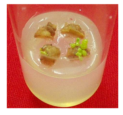
Fig. 2. Regeneration from callus on hygromycin selection medium.

Note: CL: Cotyledonary leaf Hy: Hypocotyl H: Healthy Y: Yellowing D: Dead